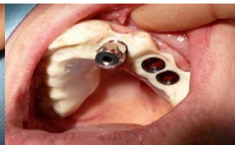
After insertion of the implant in region 21, the insertion aid remains for fixation