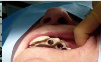
Checking the fit - Position of the drilling template in situ