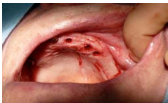
Situation after inserting the implants and removing the insertion posts