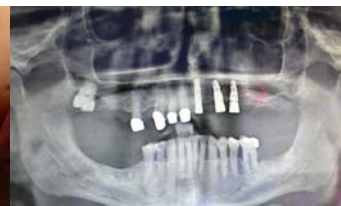
Check OPG - The gingiva former 25 was readjusted subsequently