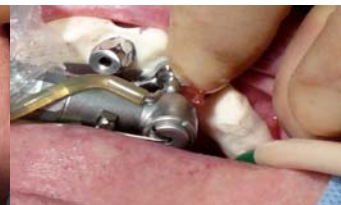
Finishing the last implant site in region 22 - final drilling