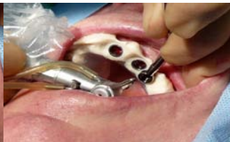
Checking the fit - Finishing with the countersink and, if necessary, with the thread cutter before insertion of the implant through the template