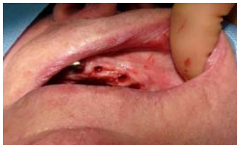
After punching the tissue, region 21, 24 and 25