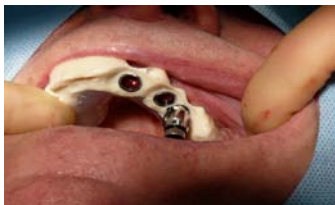
Additional fixation of the template with the insertion aid (IMPLA Position Key)