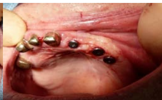
Situation after setting in the gingiva formers