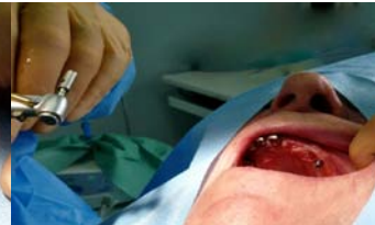
Machined punching - punch guidance positioned with help of initial drilling